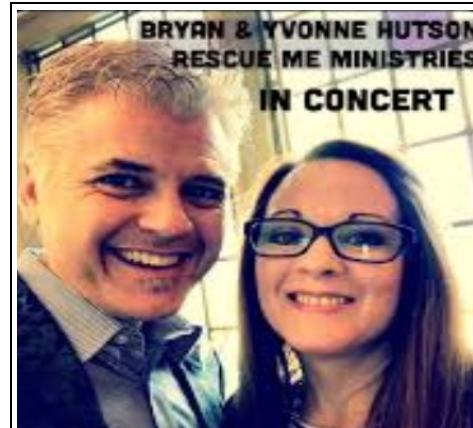
5th Saturday Gospel Concert Saturday, March 30 @ 6:00pm

Thursday, April 18 Quarterly SWBA Executive Board Meeting East Hamilton Baptist Church—7:00pm