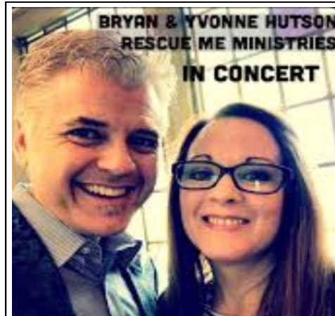
5th Saturday Gospel Concert Saturday, March 30 @ 6:00pm

Check out the insert in this week's bulletin for the names that are being considered for our church. Feel free to select up to your three favorite names.