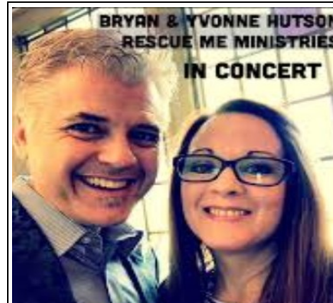
5th Saturday Gospel Concert Saturday, March 30 @ 6:00pm

Thursday, April 18 Quarterly SWBA Executive Board Meeting East Hamilton Baptist Church—7:00pm